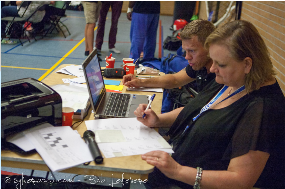
Fig. 1: Pooling

The FCS consists of 5 levels and classifies judoka based on insight, power, speed, will to win and Judo capability, but empathically not on handicap or disability.