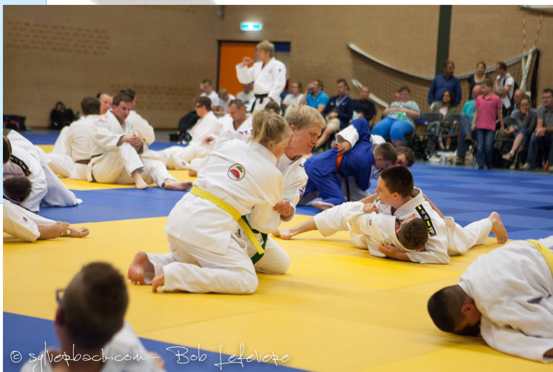
Fig. 2: Divisionering workshop in progress

Level 5 is a judoka who can grapple and play with other judoka of the same level. These judoka are very passive, or respond very slowly. Constant coaching to take action is necessary. When they end up in osae-komi , the action to break free can take a very long time.